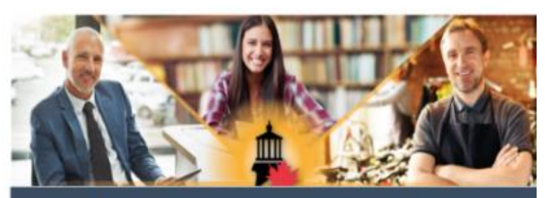
Find out how to hire a candidate with the Atlantic Immigration Pilot